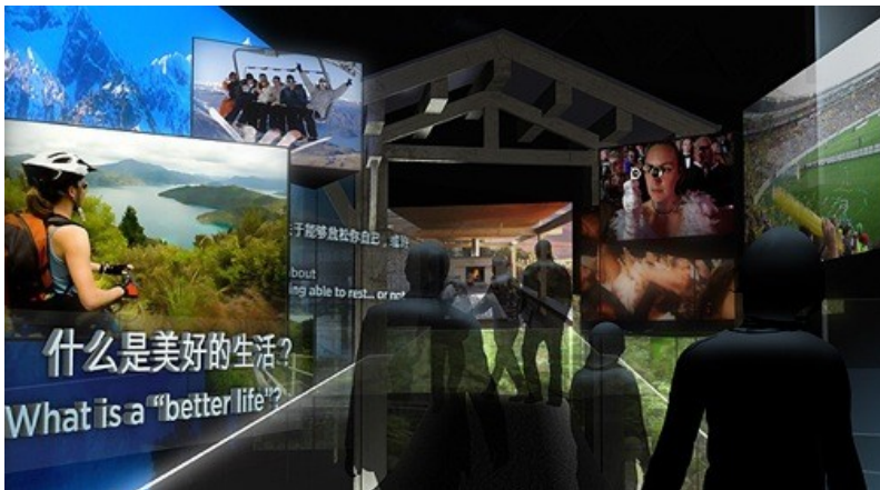
New Zealand Pavillion, Shanghai Expo 2010

The Expo is a different event from the World Cup or the Olympics. Since the vast majority of the expected 70 million visitors to the Expo in Shanghai will be from across China over a six-month period, it will be a rare opportunity for countries to forge a dialog with the Chinese public through their branded pavilions (e.g., New Zealand , Sweden ).