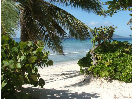
Caribbean Beach

tourism example in the digest embodies a pan-region approach that transcends individual localities.