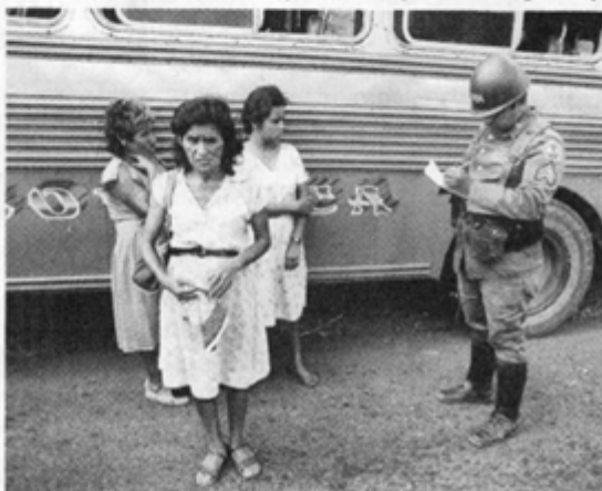
National Guardsman checking movement of civilians in El Salvador, where 30% of the population has been displaced by the war.

More than a year ago, the Denver city council considered whether to make Denver a city of refuge for Nicaraguans and Salvadorans displaced by the wars in their countries. The ordinance would have called upon city employees — including police — to refrain from helping federal immigration officials to deport Salvadorans. That measure, however, never came