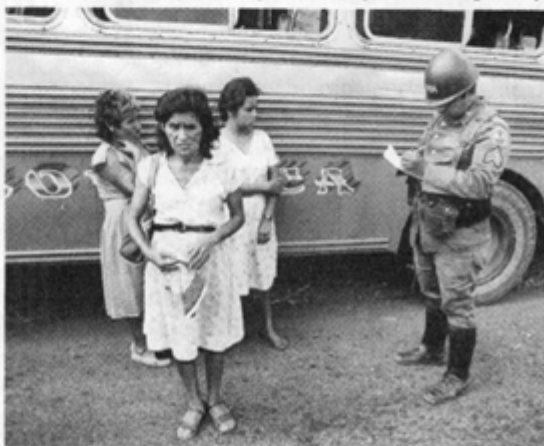
National Guardsman checking movement of civilians in El Salvador, where 30% of the population has been displaced by the war.

More than a year ago, the Denver city council considered whether to make Denver a city of refuge for Nicaraguans and Salvadorans displaced by the wars in their countries. The ordinance would have called upon city employees — including police — to refrain from helping federal immigration officials to deport Salvadorans. That measure, however, never came