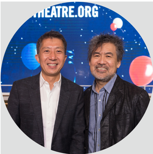
With David Henry Hwang, playwright and lyricist of "Soft Power," which premiered in Los Angeles