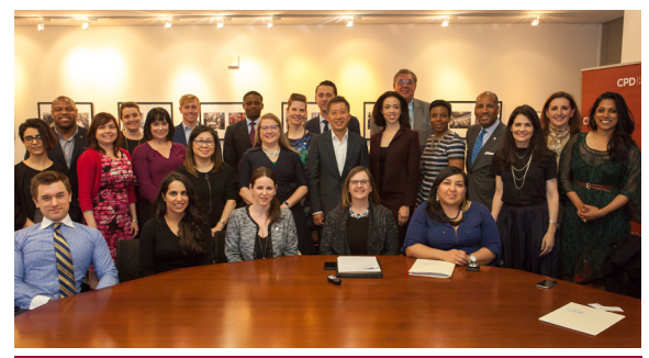
Participants from Atlanta, Austin, Birmingham, Boston, Charlotte, Denver, Houston, Los Angeles, New York, Newark, Oakland, Philadelphia, San Antonio, San Diego, San Francisco, San Jose, Seattle and Silicon Valley