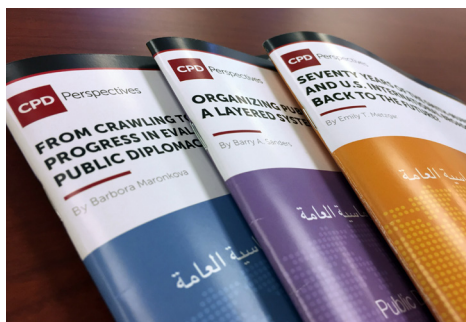
2018 Issues of CPD Perspectives on Public Diplomacy