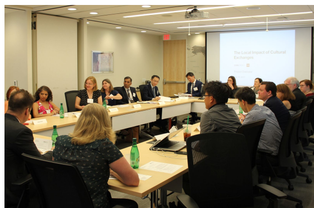
Participants in CPD's workshop at Global Ties U.S. including representatives from the State Department and the EU