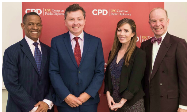
Panelists from CPD event on challenges of conducting public diplomacy in conflict environments