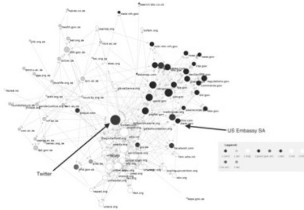
Figure 2: U.S. Embassy in Pretoria Web Network

In Figure 2, we can identify the U.S. Embassy South Africa website in the bottom right hand corner of the network. This figure expresses the embassy's relative position in the broader issue network, not limited to South African URLs. From this image, we can see that the U.S. Embassy SA is, not surprisingly, embedded within a sub-network of U.S. government properties (i.e. those with .gov URLs such as grants.gov, usa.gov, USAID.gov, etc. in the bottom right of Figure 2). While the embassy links to a number of SA sites, including South African government sites (i.e. those with gov.za URLs in the top half of Figure 2) and nonprofits (e.g. Media Institute of Southern Africa), these links are not reciprocal. We can also identify that Twitter is the most critical node in the U.S. Embassy SA's immediate network, suggesting that it is a key intermediary between actors in this network. 58 The Followerwonk social authority index provides a small indication of this discrepancy; as of January 12, 2015, 64.9% of @StateAfrica followers have a social authority index of less than 10 out of 100 (with 100 being the highest), while only 8.7% of the users that @StateAfrica follows have a similarly low score. This social authority index is calculated by a combination of user