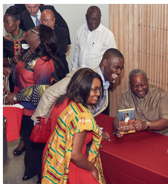
Book signing with USC students and members of the local community