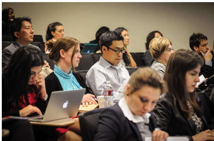
Public Diplomacy &amp; Development Communications Symposium