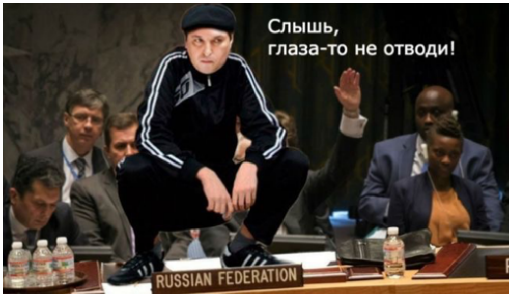
Caption: "Hey, don't turn your eyes away!"

and disappointment with such behavior. Dozens of Internet memes and images of Safronkov showed disapproval and marginalization of Russian diplomatic culture. Safronkov's tone and emotional outrage resemble the "gopnik style," a particular subculture of lower-class suburban areas of Russia.