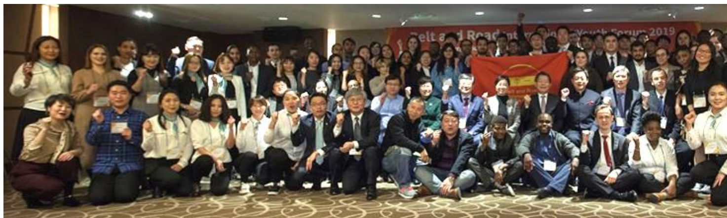
Commemoration photo of the first BRIYF

The first BRIYF was arranged in Seoul, South Korea on February 26, 2019. The organizing committee selected the intersections between the BRI and the sustainable development goals (SDGs) as the main theme of the event. This theme covered the linkages between the BRI and the SDGs. The participants had a chance to investigate the linkages between the BRI and the SDGs and how they could be complemented. In my opinion, stipulating the connections with the SDGs is a constructive way to create synergy between “Chinese characteristics” and global norms of international development.