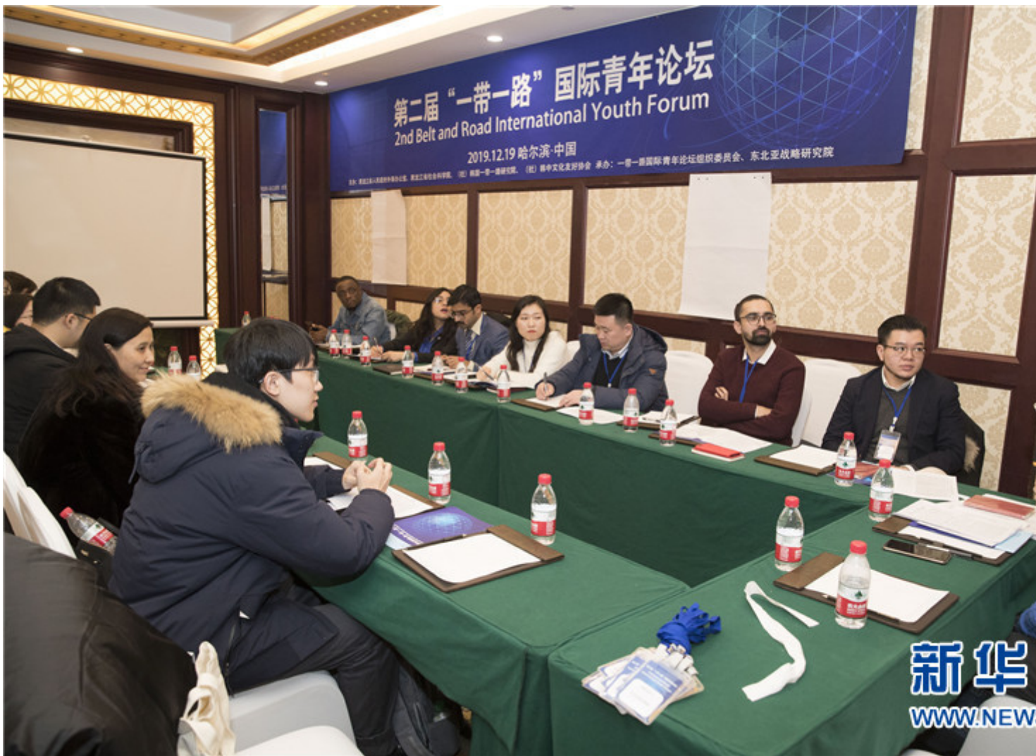
Group discussion at the second BRIYF