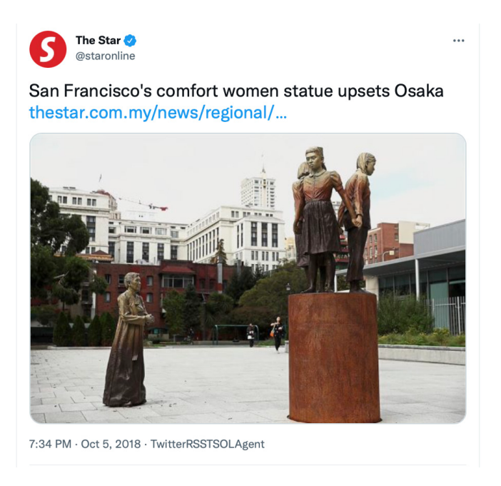
Figure 4. Osaka, Japan severed sister-city relations with San Francisco after Mayor London Breed supported the installation of the "Comfort Woman" memorial, to commemorate the horrors women and girls faced during World War II.

In pursuing contemporary forms of public diplomacy, Black women elected officials in the United States do not shy away from speaking boldly about injustices and inequities even as they advance the business of globalizing their cities and municipalities, both with Western nations and creating new ties with developing countries, particularly on the African continent and across the African Diaspora. In the past, Black women diplomats equivocated between their own philosophies about injustices, in an effort to execute their jobs on behalf of the state. As America's first Black woman diplomat put it: "One is always a spokesman