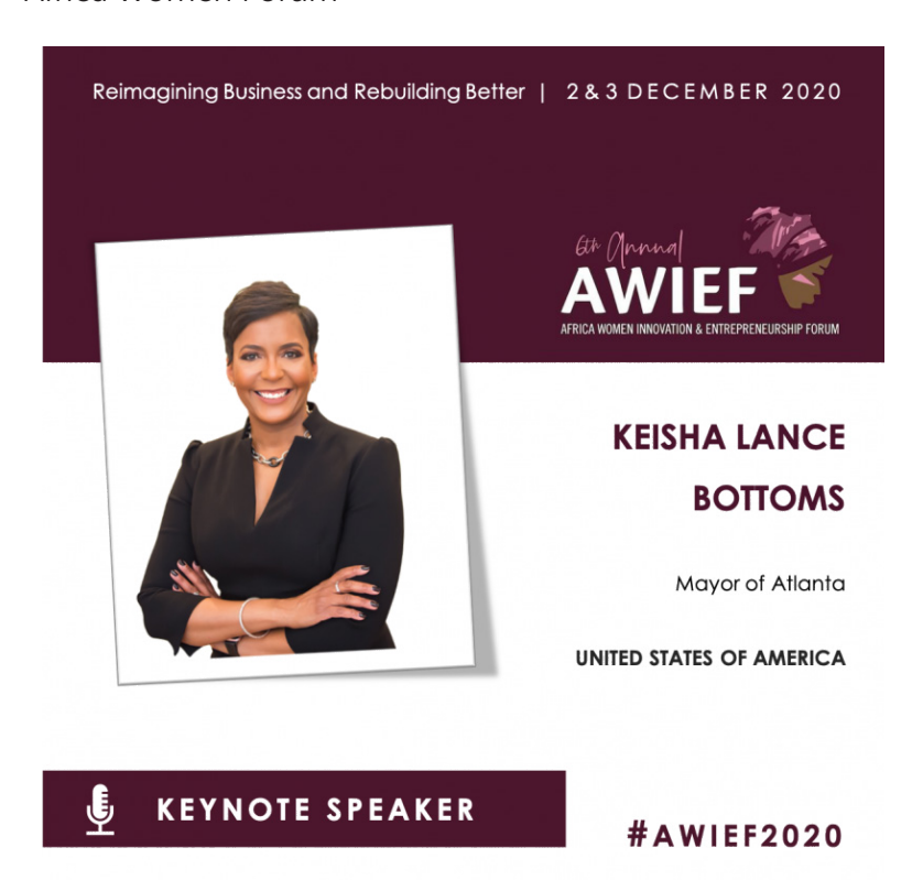
Figure 3. Virtual Public Diplomacy. Flyer of Atlanta Mayor Keisha Lance Bottoms as keynote speaker for the 2020 Africa Women Forum

Lance Bottoms was invited as the mayor of one of the U.S.'s top five cities for Black-owned businesses. In her remarks, Lance Bottoms spoke not only of the Black innovation and entrepreneurship in Atlanta, but the history of Atlanta in the Civil Rights Movement and its role in fighting for equity and justice around the world.