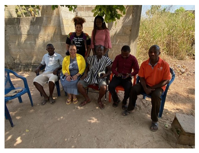
Figure 2. New Orleans Mayor Latoya Cantrell in Kumasi, Ghana, 2019.

Cantrell reflected on her time spent with ordinary Ghanaians: