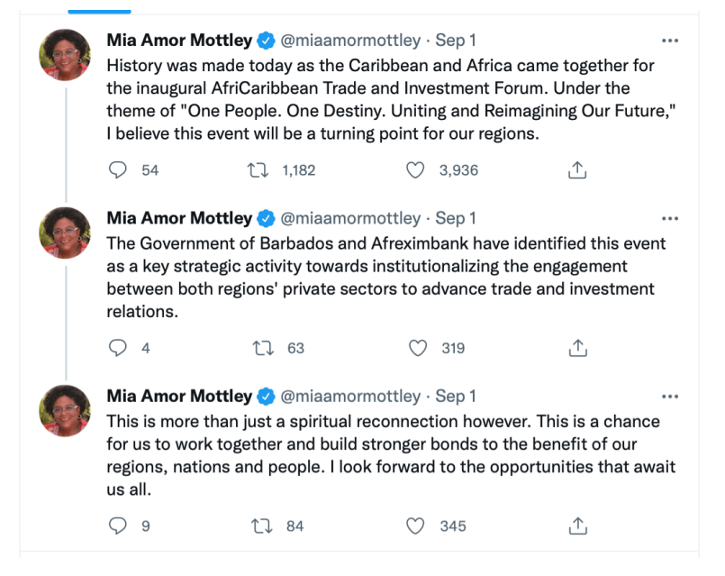
Figure 6. Barbados Prime Minister Mia Mottley heralds a new era of Caribbean and African solidarity around mutual investment, climate resiliency, and cultural solidarity.

Building solidarity among people of African descent is also taking place within one continent as the new Colombian government seeks to embark on its new progressive politics in South America and across the Western Hemisphere. At the heart of this strategy is Colombia's first Black woman vice president Francia Márquez, who has been an advocate for women, the poor, and the marginalized long before her activism put her at the center of Colombia's political shifts.