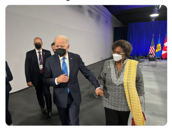
9:35 AM · Nov 2, 2021 from Glasgow, Scotland · Twitter for iPhone

President Biden and I walking out of the US-EU Build Back Better World Forum held in the margins of #COP26 moments ago.