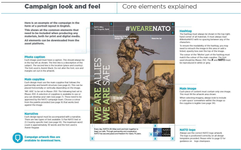
Figure 3: Sample of a toolkit of the NATO Campaign WEARENATO