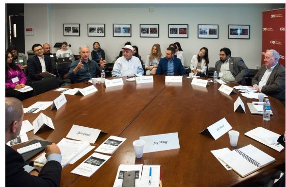
Faculty members from USC and University of Florida contribute to the panel discussion on public diplomacy in the digital age