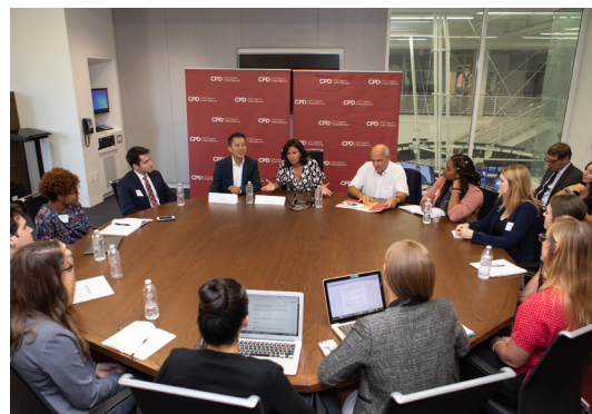
Mayor Hidalgo speaking to a small group of USC students