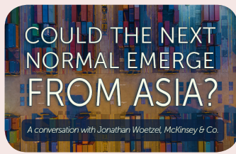
Could the Next Normal Emerge from Asia? Prospects & Implications (May 6)