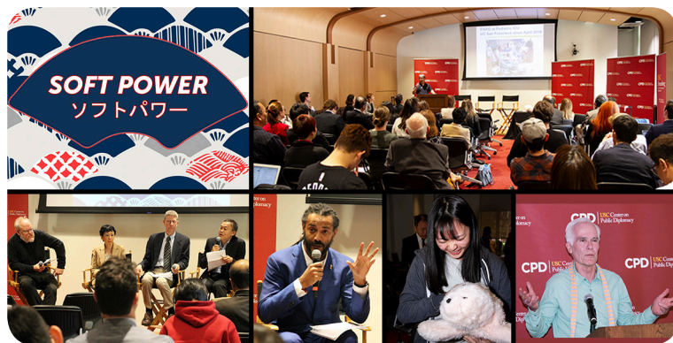
CPD's conference on Japan's soft power addressed a range of topics including the Tokyo Olympics, high-tech developments such as the therapeutic baby harp seal robot PARO, gastrodiplomacy and cultural insights via Japan House LA and much more. (Feb. 28)