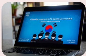
Crisis Management & PD during Coronavirus: Lessons from South Korea (April 16)