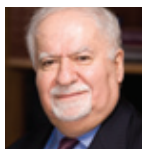
Vartan Gregorian , President, Carnegie Corporation of New York

Prior to becoming co-chair at CAA, Ambassador Gelb was appointed Commissioner for the UN, Consular Corps and International Business. He served as Ambassador to Belgium and as Director of the U.S. Information Agency from 1989-1991.