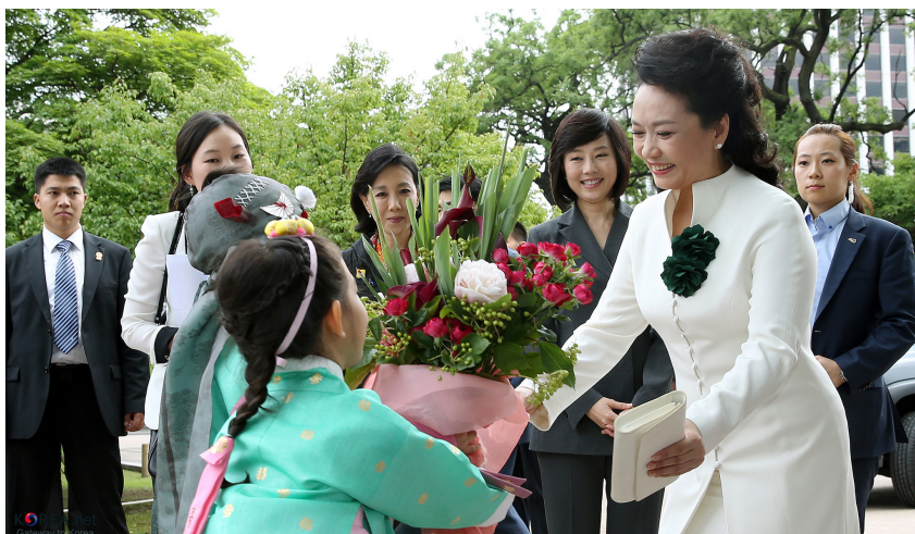
Chinese First Lady Peng Liyuan visiting Changdeokgung Palace in Seoul, 2014.

Beginning with the historic meeting between First Ladies Peng Liyuan and Michelle Obama, Baik's paper outlined the roles of First Ladies in China and the United States, noting the differences in how socialist and democratic nations view the spouses of heads of state. It also details Ms. Peng's diplomatic initiatives and state-sponsored visits to foreign nations.