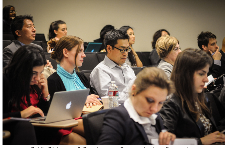
Public Diplomacy & Development Communications Symposium