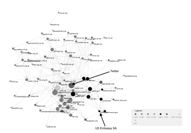
Figure 2: U.S. Embassy in Pretoria Web Network

In Figure 2, we can identify the U.S. Embassy South Africa website in the bottom right hand corner of the network. This figure expresses the embassy's relative position in the broader issue network, not limited to South African URLs. From this image, we can see that the U.S. Embassy SA is, not surprisingly, embedded within a subnetwork of U.S. government properties (i.e. those with .gov URLs such as grants.gov, usa.gov, USAID.gov, etc. in the bottom right of Figure 2). While the embassy links to a number of SA sites, including South African government sites (i.e. those with gov.za URLs in the top half of Figure 2) and nonprofits (e.g. Media Institute of Southern Africa), these links are not reciprocal. We can also identify that Twitter is the most critical node in the U.S. Embassy SA's immediate network, suggesting that it is a key intermediary between actors in this network.<sup>58</sup> The Followerwonk social authority index provides a small indication of this discrepancy; as of January 12, 2015, 64.9% of @StateAfrica followers have a social authority index of less than 10 out of 100 (with 100 being the highest), while only 8.7% of the users that @StateAfrica follows have a similarly low score. This social authority index is calculated by a combination of user