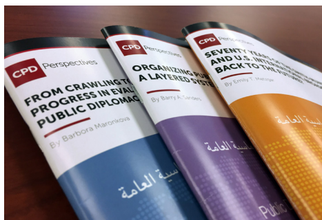
2018 Issues of CPD Perspectives on Public Diplomacy