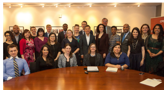
Participants from Atlanta, Austin, Birmingham, Boston, Charlotte, Denver, Houston, Los Angeles, New York, Newark, Oakland, Philadelphia, San Antonio, San Diego, San Francisco, San Jose, Seattle and Silicon Valley