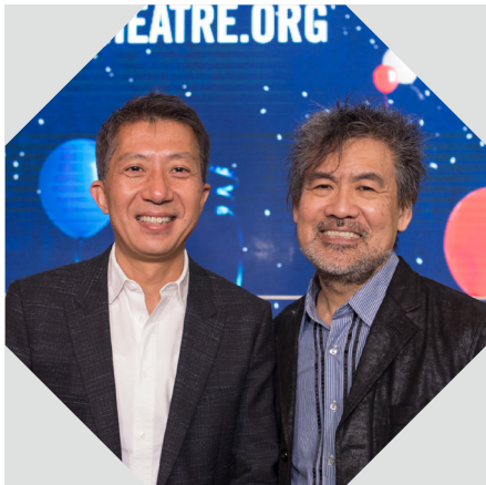
With David Henry Hwang, playwright and lyricist of "Soft Power," which premiered in Los Angeles